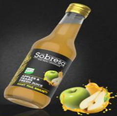
APPLES & PEARS FRESH JUICE

Ingredients: 75% natural apple juice, 25% sour cherry juice + origin Romania