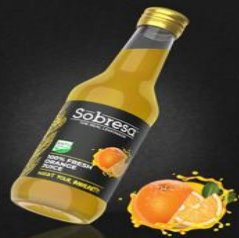
100% FRESH ORANGE JUICE

Ingredients: 75% natural apple juice, 25% pear juice + origin Romania