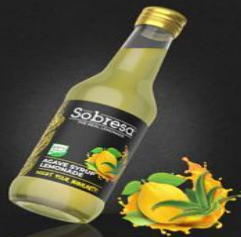
AGAVE SYRUP LEMONADE

Ingredients: 14% natural lemon juice + origin Spain 9% agave syrup, filtered water