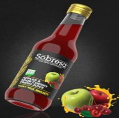
APPLES & SOUR CHERRY FRESH JUICE

Ingredients: 75% natural apple juice, 6,25% blackberry juice, 6,25% raspberry juice, 6,25% blueberry juice + origin Romania