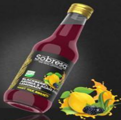
BLACKBERRY, ARONIA & AGAVE SYRUP LEMONADE

Ingredients: 14% natural lemon juice + origin Spain 9% agave syrup, filtered water