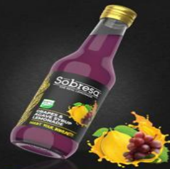
GRAPES & AGAVE SYRUP LEMONADE

Ingredients: 100% orange juice + origin Spain