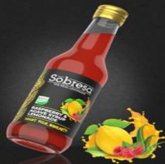
RASPBERRY & AGAVE SYRUP LEMONADE

Ingredients: 12% natural lemon juice + origin Spain + 8% natural blackberry juice, 2% aronia juice, 6% agave syrup, filtered water