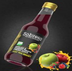
APPLES & FOREST FRUITS FRESH JUICE

Ingredients: 10% natural lemon juice + origin Spain + 10% natural raspberry juice, 6% agave syrup, filtered water